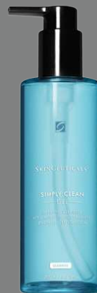
SkinCeuticals Simply Clean Cleanser $35