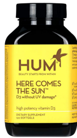
HUM ® HERE COMES THE SUN VITAMIN D SUPPLEMENT $20